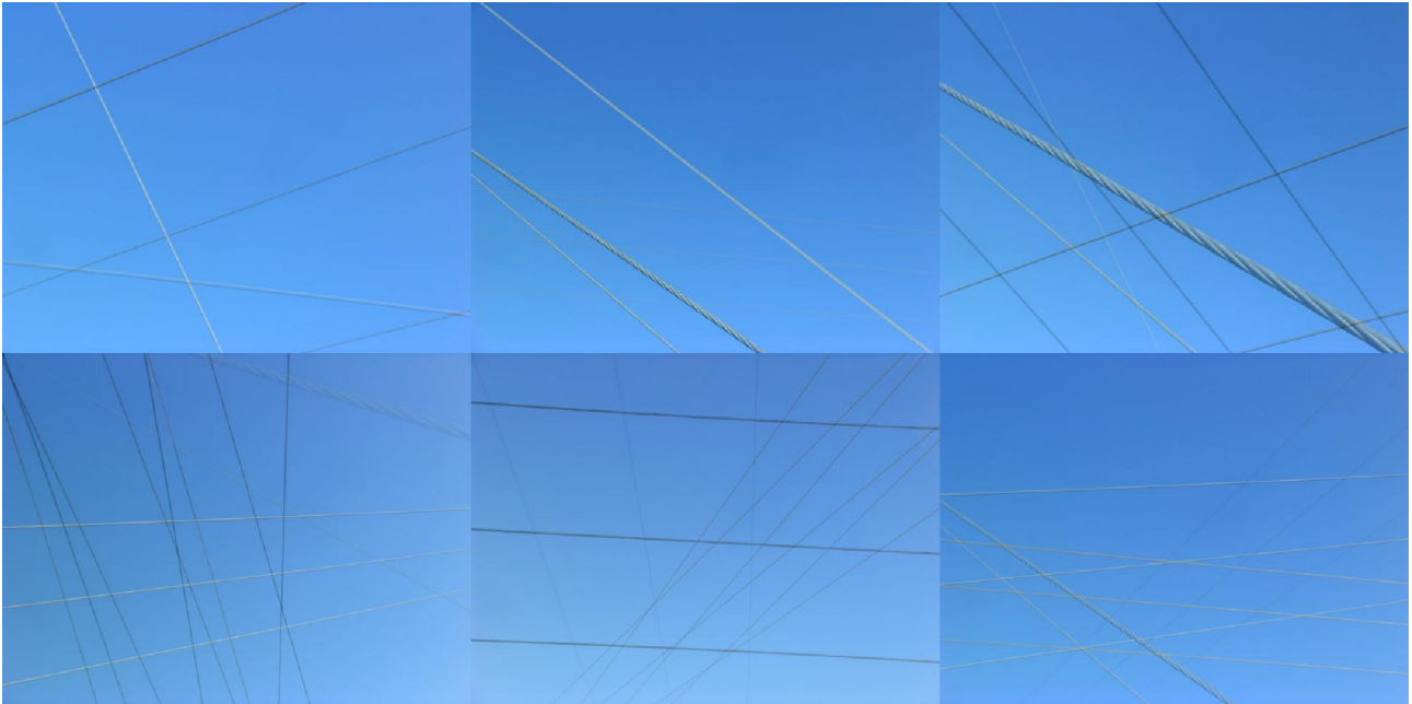
[stills from textur #4, 2009]

Series of audiovisual performances, combining phonography and photography, 2005 - 2009