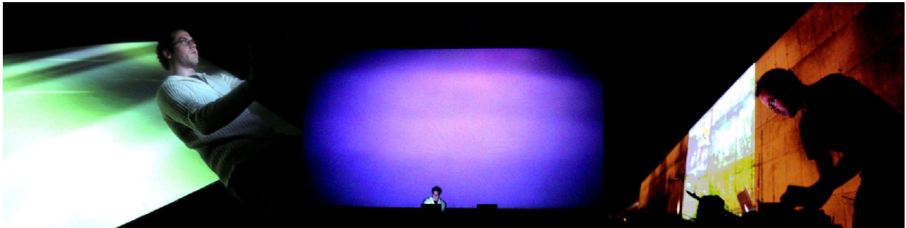
[Gal live in Taipei 2007 (1+2) and Mendoza 2006 (3)]