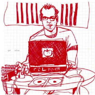
[CD 'relive', Gromoga, 2008]