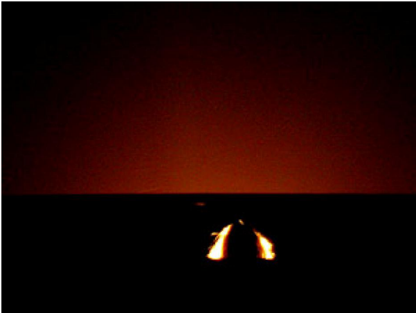
[B. Beslic performing '88' at SKC, Belgrade, April 2009]

Composition for (amplified) piano and light projection, 2003